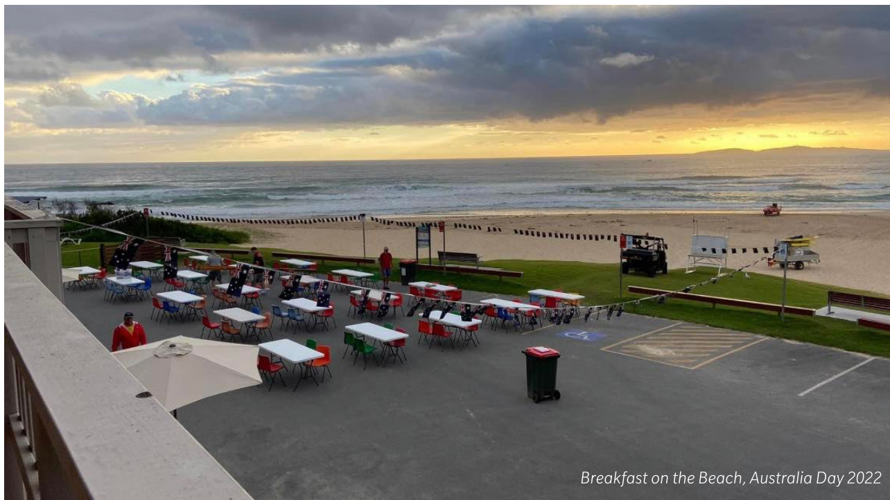
Breakfast on the Beach, Australia Day 2022