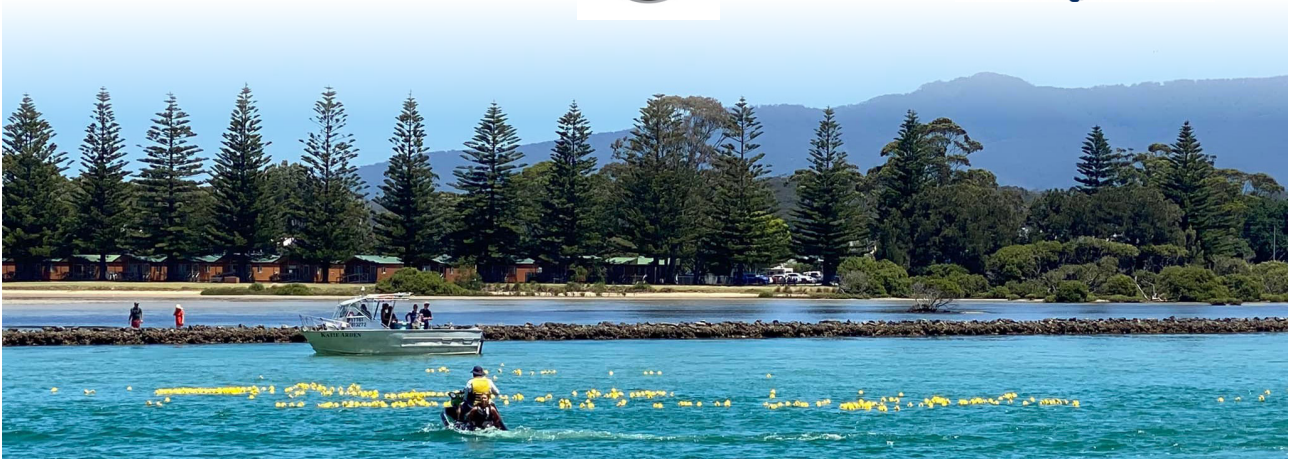
New Years Day Duck Race, Wagonga Inlet