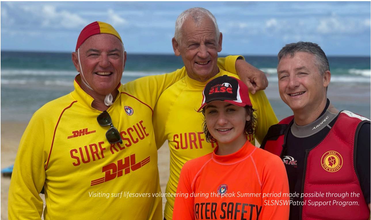
Visiting surf lifesavers volunteering during the peak Summer period made possible through the SLSNSW Patrol Support Program.