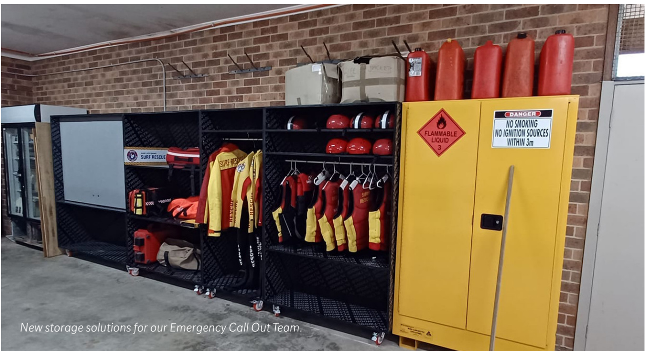
New storage solutions for our Emergency Call Out Team.