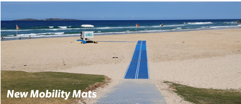
New Mobility Mats